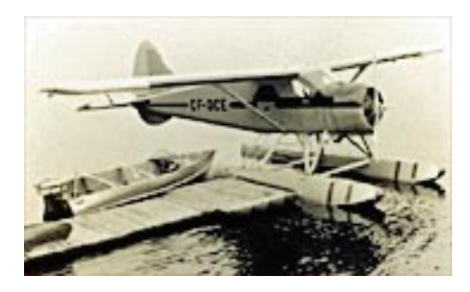
De Havilland DHC-2 Beaver

Many innovations found in the Beaver were based on the answers to a questionnaire de Havilland Canada sent to bush operators across the country. The result? The best small utility aircraft in the world! Its all-metal structure was a first for Canadian-designed bush aircraft. Its effective wing and flap design gave it excellent STOL performance. The floor hatch and wide doors handled rolled-in fuel drums and bulky cargo, saving time and money.