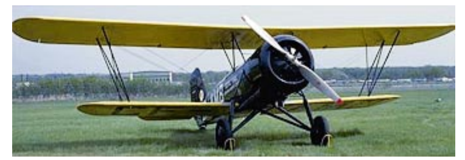
Stearman 4EM Junior Speedmail

It had an automatic pilot, could fly safely on one engine and had retractable landing gear. The 247 made all other airliners obsolete. It even flew faster than the military aircraft of its time. The Lockheed 10A Electra was Trans-Canada Air Lines' first new airplane delivered in 1937. TCA started up with two secondhand Electras and a Stearman Model 4 mailplane.