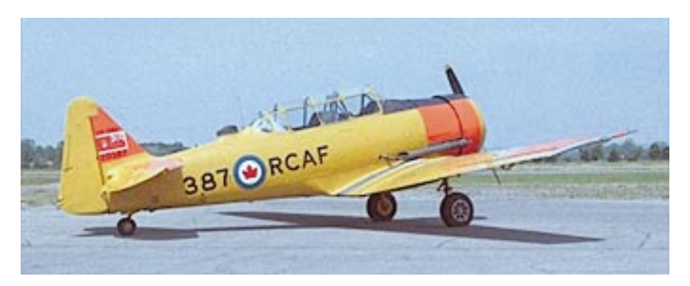
North American Harvard 4 (2532)

One cluster of airplanes stands out boldly from all the others in the Museum collection. Their bright yellow colour identifies these machines as training aircraft used in the British Commonwealth Air Training Plan (BCATP). The plan produced airfields all across Canada and helped create a modern, mass-production aircraft industry in this country. All BCATP trainers in the Museum – the Harvard, the Anson, the Tiger Moth, and the Finch – were built in Canada.