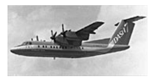
De Havilland DHC-7 Dash 7

Eventually, the Beaver became the most numerous of all Canadian-designed aircraft with 1691 manufactured. Hundreds of Beavers are still flying more than fifty years after the first one took off. The Museum's specimen is, appropriately, the prototype Beaver, acquired in 1980 after almost thirty-three years of rugged flying.