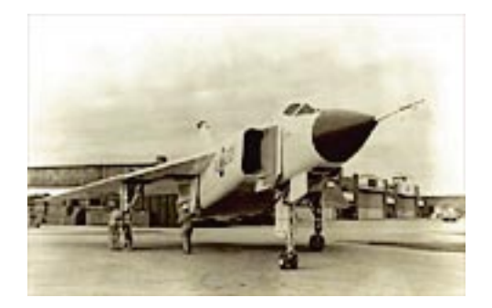
Avro Canada CF-105 Arrow

Immediately after the war, commercial aviation mushroomed. From nine million passengers worldwide in 1945, the number climbed to twenty-four million in 1948. The widespread introduction of jet transport beginning in the late 1950s created a revolution in speed, comfort, and efficiency similar to that of the first modern airliners in the 1930s.